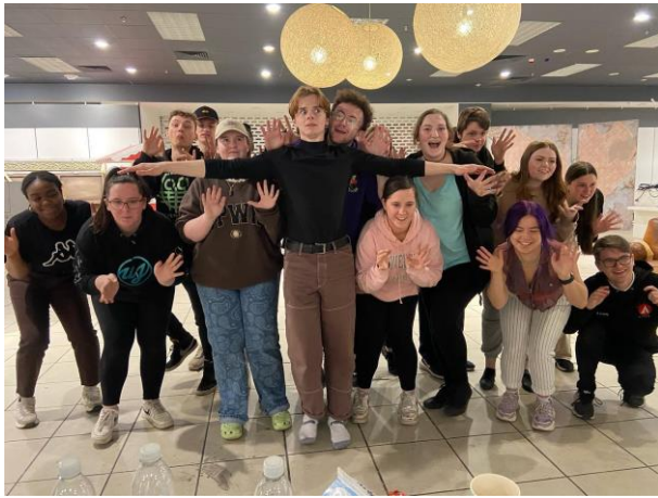
Rehearsals underway at Ocean Terminal