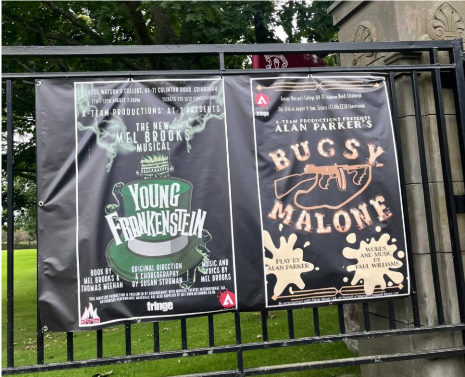
AT-2 presents "Young Frankenstein"