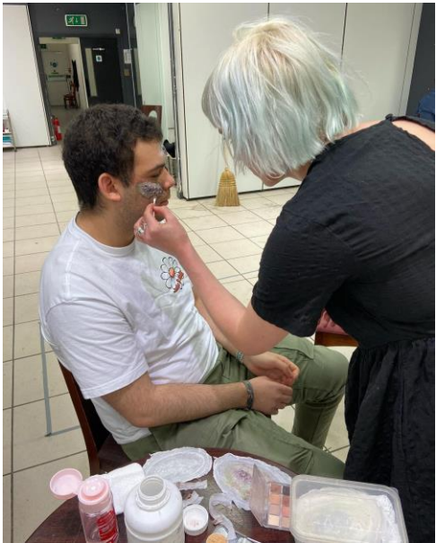
Prosthetics, Hair & Makeup practice